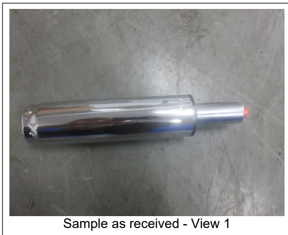
Sample as received - View 1